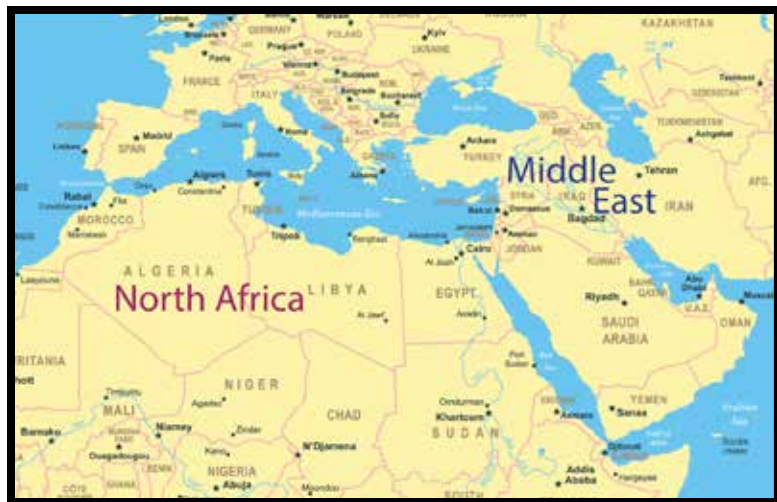
Countries located within the Middle East North Africa Region.

There are different configurations of the region, depending on who is doing the configuring. Some have defined the region broadly, including Afghanistan, Pakistan, and more countries in North Africa. In time, we hope to expand CBSI into all of these countries.