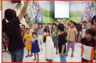
Top: Children and leaders gather at C&Y class in Japan. Bottom: C&Y leader enthusiastically teaches kids in Indonesia.

For some time, CBSI ministry in these places had plateaued. It's exciting to see God breathing fresh wind and fire into these nations today. Our Country Directors are looking to the future with joyful anticipation of great things yet to come.